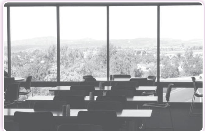
Students who need to grab a quick lunch or want a place to relax find the atmosphere they seek in the Oceanside Campus cafeteria, where the views are breathtaking.